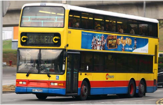
E22 Airport Bus

Airport Bus route E22 departs from the airport every 15 minutes which takes around 45 minutes to arrive at HKBU Junction Road station , which is just 10-minute walking distance to NTTIH. http://mobile.nwstbus.com.hk/nwp3/?f=0&l=0