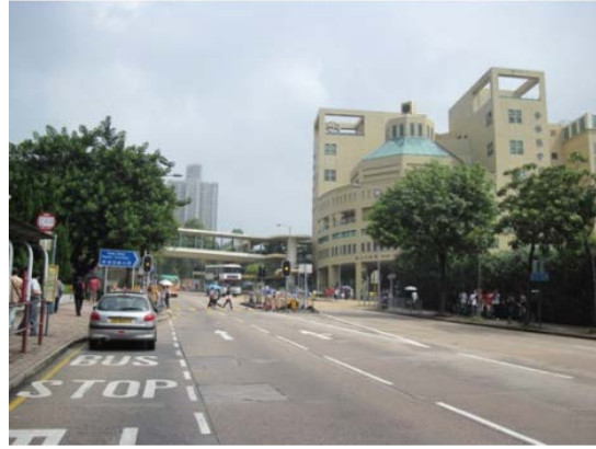
HKBU Junction Road station