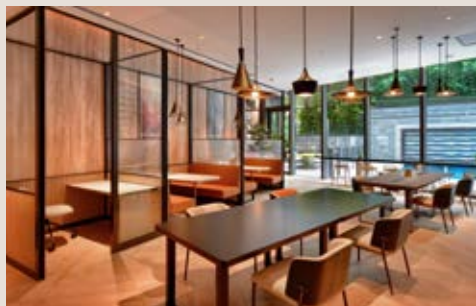
闲坐 LIVING ROOM