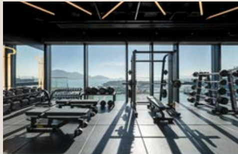
重量训练室 BEAST STUDIO