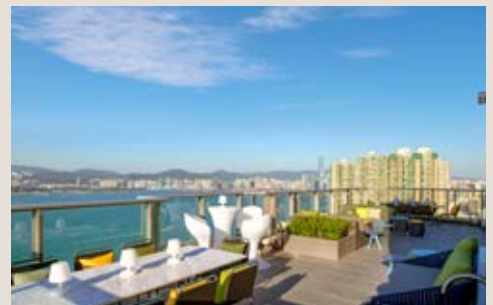
烧烤区 BBQ AREA