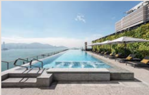
无边际泳池 SKYBOUND POOL