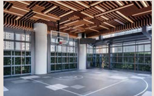
篮球及匹克球场 BASKETBALL & PICKLEBALL COURT