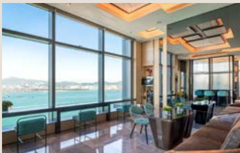
海景闲坐 SEAVIEW LOUNGE