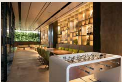
休闲工作间 WORK SPACE