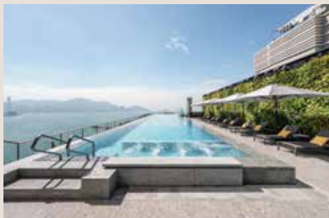
无边际泳池 SKYBOUND POOL