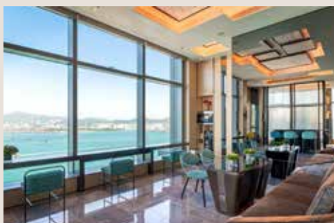
海景闲坐 SEAVIEW LOUNGE