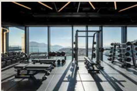
重量训练室 BEAST STUDIO