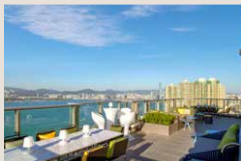
烧烤区 BBQ AREA