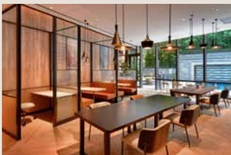
闲坐 LIVING ROOM